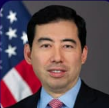
Mark T. Uyeda Commissioner U.S. Securities and Exchange Commission