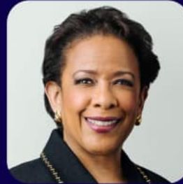
Loretta Lynch Former Attorney General of the United States and Partner Paul, Weiss, Rifkind, Wharton & Garrison LLP