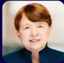
Mary Jo White Former Chair U.S. Securities and Exchange Commission and Former United States Attorney for the Southern District of New York