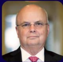
General Michael Hayden Former Director CIA and NSA