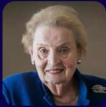
Madeleine Albright Former Secretary of State