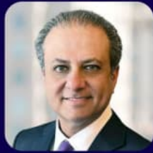
Preet Bharara Former United States Attorney, United States Attorney's Office Southern District of New York