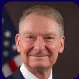
Paul S. Atkins Chairman U.S. Securities and Exchange Commission