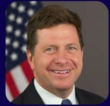
Jay Clayton Chairman U.S. Securities and Exchange Commission