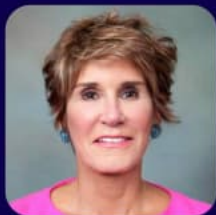
Mary Matalin Celebrated Conservative Voice and Former Presidential Advisor