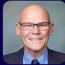
James Carville Political Consultant Author