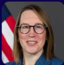
Hester M. Peirce Commissioner U.S. Securities and Exchange Commission