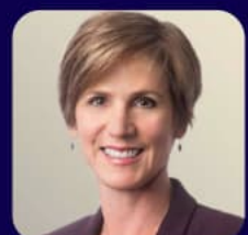
Sally Q. Yates Former Deputy Attorney General